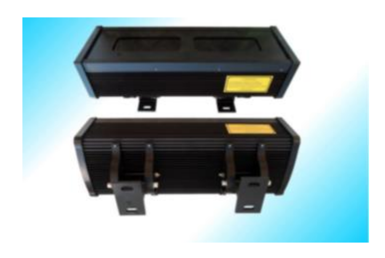
Illuminates 20" x 14" (500 x 300 mm) area – uniformly