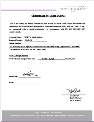
CERTIFICATE OF LIGHT OUTPUT